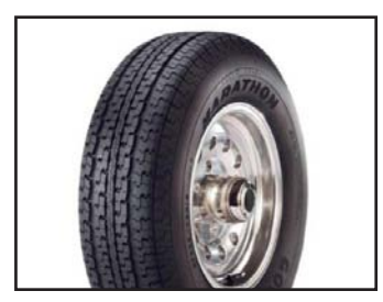
> Goodyear Marathon Radial Tires