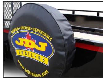
> Mounted Spare Tire