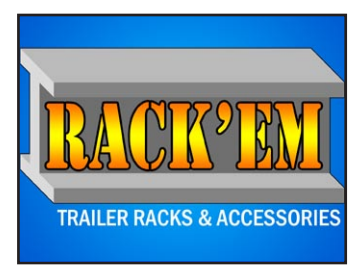
> Rack'Em Accessories