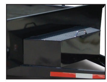
> Steel Toolbox